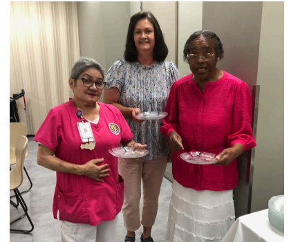
I do believe Emerita is hungry!

Sweet greetings and hugs greeted those who recently attended the Thank Pink luncheon! Each year the volunteers are honored during National Volunteer Week with thankfulness for all they do throughout the hospital. DVS Hilary Willis welcomed the group and praised each one for their service-delivered with kindness that may go unnoticed but makes such a difference in healthcare deliverance. Everyone enjoyed the opportunity to catch up with those they may not often encounter on their volunteer day(s). Hilary gave each volunteer an insulated travel mug inscribed with "SGMC Health Volunteer".