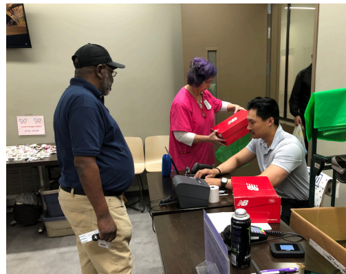
If the shoe fits, buy it- maybe two pairs!