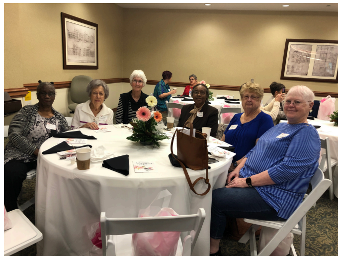
Showers did not keep this crew from arriving on time!