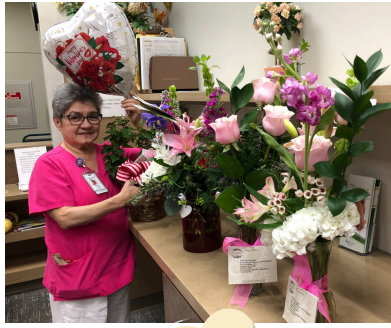
Happy Heart Day to employees and patients!