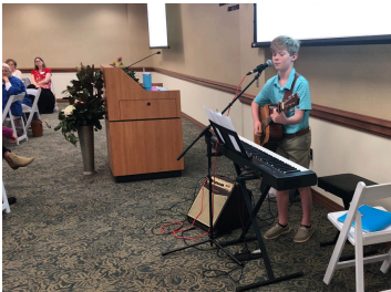
Such a pretty setting!

Our ladies swept the door prize drawing before the meeting adjourned! Oohs and Ahaas were heard as items donated by each Auxiliary were opened.....everyone departed after a wonderful meeting and anticipating the State gathering in Macon in October.