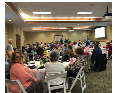
A full house!

Our ladies swept the door prize drawing before the meeting adjourned! Oohs and Ahaas were heard as items donated by each Auxiliary were opened.....everyone departed after a wonderful meeting and anticipating the State gathering in Macon in October.