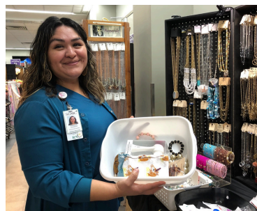
She initially said " I'm just looking and don't need a basket!" Famous last words from many Masquerade shoppers!"