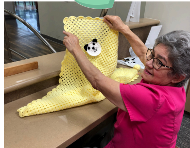
Emerita is always using her talent to bless others!