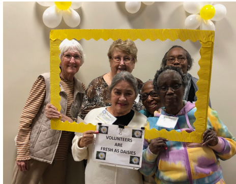
Can you find Ora?