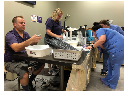
One last look