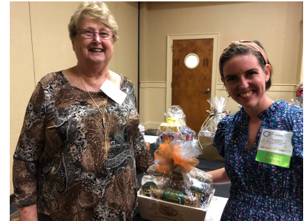
Our pecan gift basket contribution to the silent auction