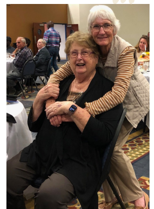
Who are these uncostumed duds?