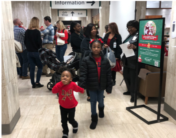
Happy faces filled the lobby!

First Quarter FY 2024 Southwest District South Georgia Medical Center