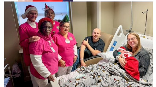
Another little one dressed in our stocking