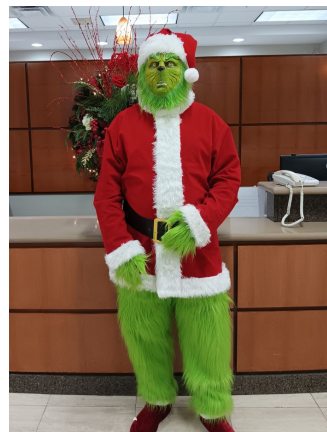
The Grinch could not steal our Christmas!