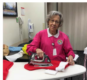
Dot irons them smooth