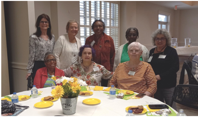
Southwest District Spring Meeting- Americus, GA