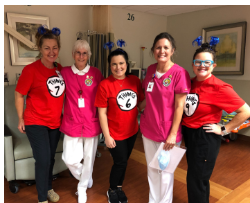
Halloween in the Cancer Infusion Room

We are glad you are still around for hugs!