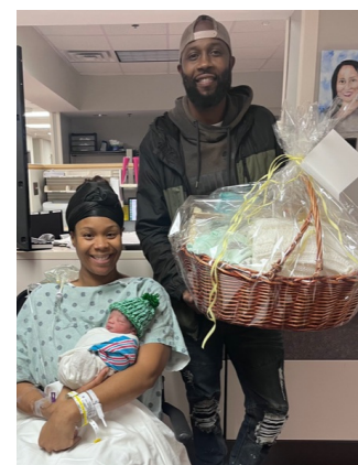
New Years Baby and Parents receive welcome basket