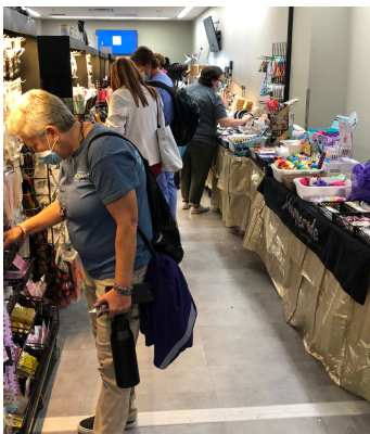
Employees enjoying shopping!