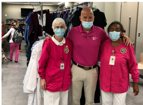
Who's the new volunteer?