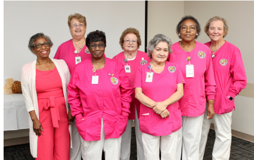
Our Board of Management