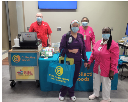
Lots of shopping went on at the Collective Goods Sale in June